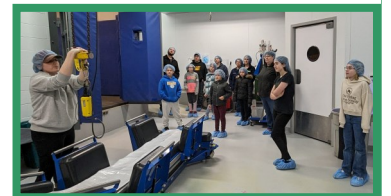
Members touring the Wisconsin Equine Clinic surgical suite