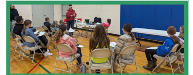
Members learning about first aid and grooming tools at Project Days

Saturday, July 20, 10a TBD Waukesha County Expo Center During Fair